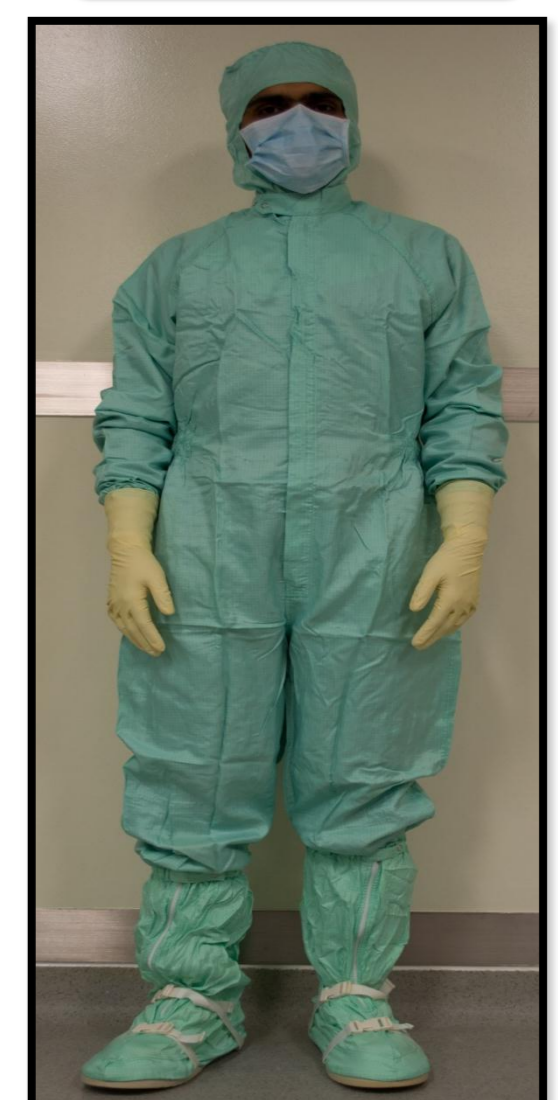
▲ Fully gowned up staff