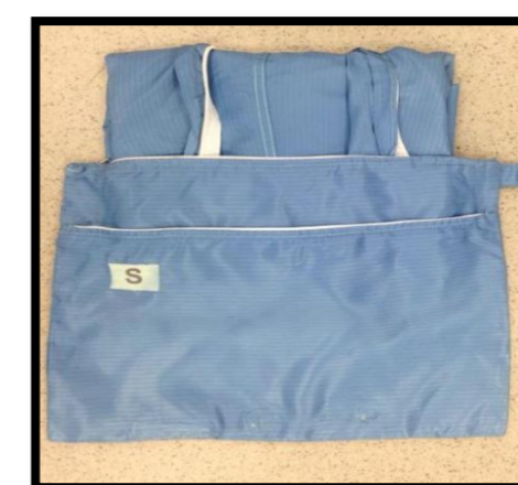
▲ Uniform in Bag